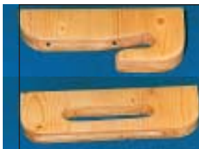
SUPPORT FOR GIRELLA PADDLE Built in compact beech wood with two elements ART. SUGIR1