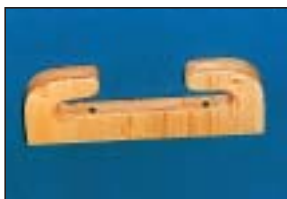
SUPPORT FOR MARGHERITA PADDLE Built in compact beech wood fixing to the wall ART. SUPMARG1