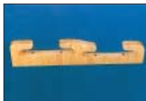
DOUBLE MARGHERITA SUPPORTS Built in compact beech wood ART. SUPMARG2