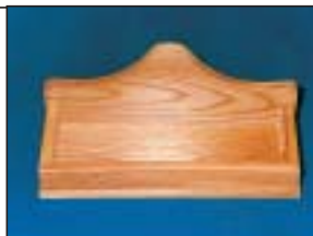
WOODEN PADDLE STAND ART. CASLEG1