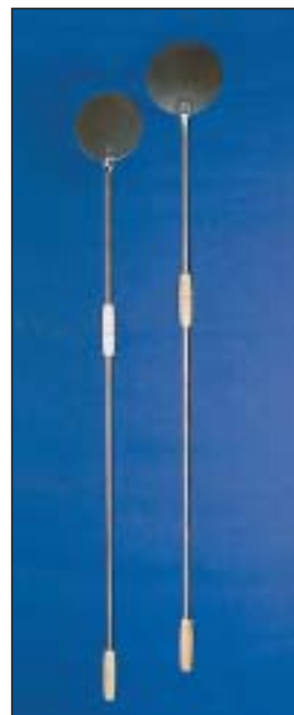
GIRELLA PADDLE Built in stainless steel with two atermic wood handles, one of them is gliding. Available in two models